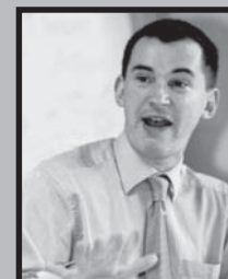
Stephen Williams Bristol West MP

53 Hampton Rd, Cotham Bristol, BS6 6HZ mark@cabot-liberals.org 0117 914 2559