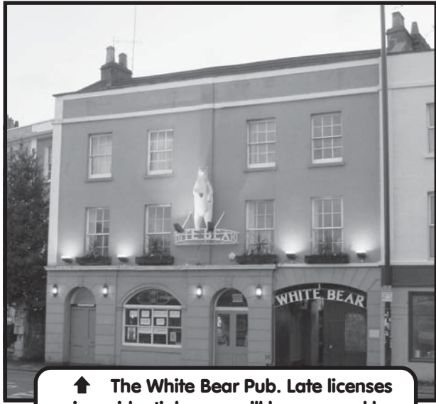
↑ The White Bear Pub. Late licenses in residential areas will be opposed by Liberal Democrats