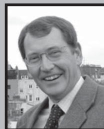
Graham Watson MEP Member of the European Parliament for the South West

Flat 6, 14 Portland Street, Kingsdown, Bristol, BS2 8HL stevewilliams@cix.co.uk 0117 944 1714